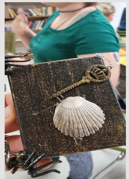
Art created by Flagship students