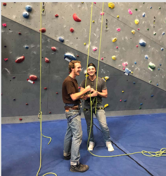
Rock Climbing at Freestone Climbing Gym