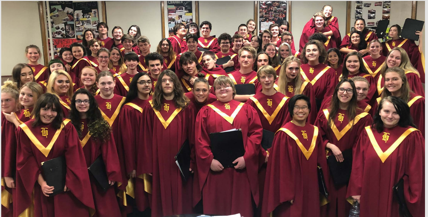
Hellgate AA Chamber Choir

On Nov 11-12, Chamber Choir participated in AA Choral Festival along with choirs from Belgrade and Big Sky. All three choirs rehearsed together for two full school days here at Hellgate. On Monday night, students were treated to a performance by UM's Chamber Chorale. On Tuesday night, each school performed two pieces individually, and then combined to form five pieces together. The combined choir included 160 singers! This was a great way to get to know singers from other schools, and make some great music together.