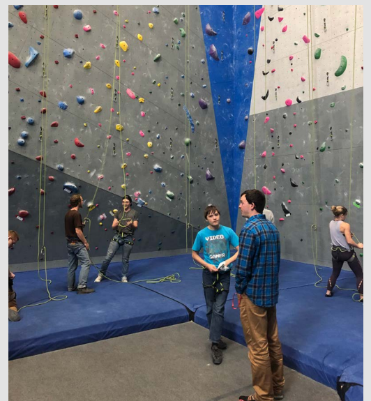
Rock Climbing at Freestone Climbing Gym