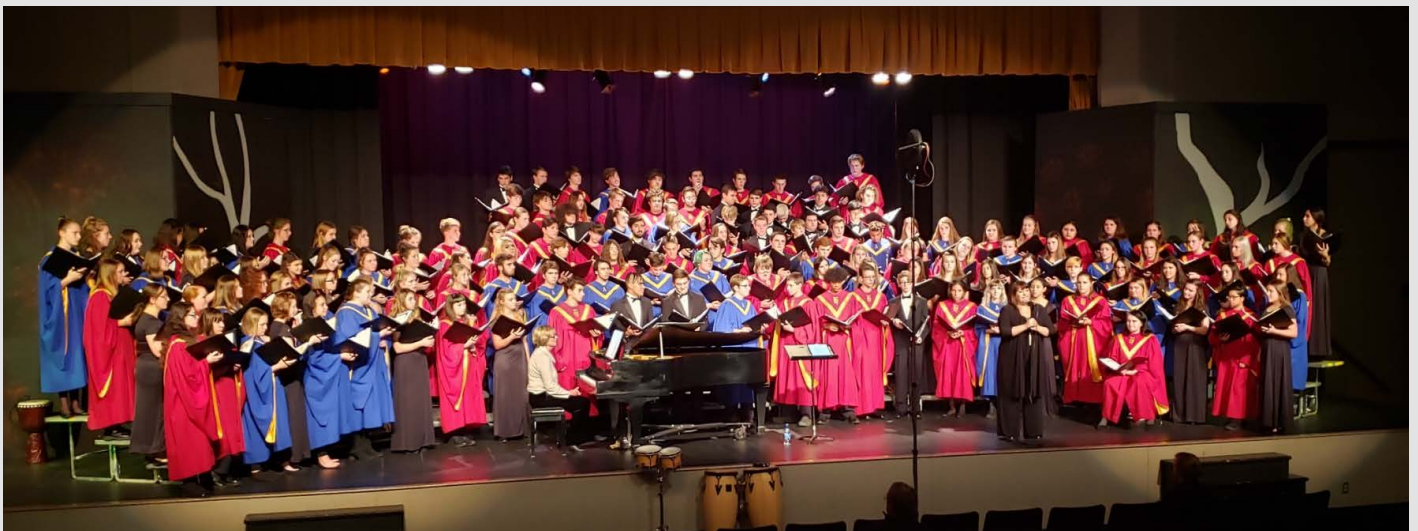
Hellgate AA Choir