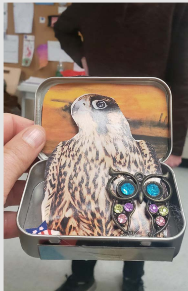
Art created by Flagship students